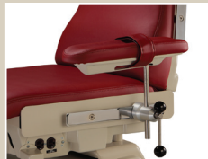
PA-110 Patient Arm Universal Mount Right or Left on BOYD's "On Track Rail System" P/N 68-6223 Putty Trim P/N 68-6223B Black Trim

slide along BOYD's "On Track Rail System". The Rail Mech allows front to back, up and down, and rotational positioning. Loosen the knob and position, tighten knob and you are locked into place. All Rail Mounted Accessories are universal and mount right or left. 2615, 2614 Models are equipped standard with Seat Rails. Back Rails are OPTIONAL. 2601, 2605 Models are equipped standard with Seat and Back Rails.