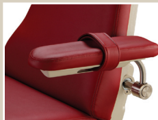
PA-220 Patient Arm; COMPENSATING Universal Mount Right or Left into BOYD Back Hub P/N 68-6224 Putty Trim P/N 68-6224B Black Trim

automatically adjust with chair back. All arms are interchangeable from side to side, removable, and width adjustable. IV Arms rotate in multi positions with the touch of a lever. Arms drop to the side and out of the way for patient access/egress. A firm locking action holds the arm stable during surgical procedures.