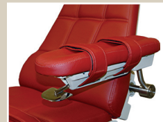
IV-219 Multi Position IV Arm Board; COMPENSATING Universal Mount Right or Left into BOYD Back Hub P/N 68-6272 Putty Trim P/N 68-6272B Black Trim