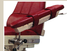
IV-123 Multi Position IV Arm Board Universal Mount Right or Left on BOYD's "On Track Rail System" P/N 68-6271 Putty Trim P/N 68-6271B Black Trim