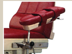
IV-119 Multi Position IV Arm Board Universal Mount Right or Left on BOYD's "On Track Rail System" P/N 68-6266 Putty Trim P/N 68-6266B Black Trim