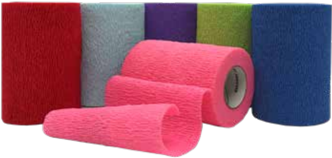
6-Pack Includes One Each: Neon Pink, Blue, Purple, Light Blue, Neon Green, Red